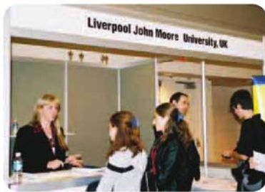
9 sq. meters booth